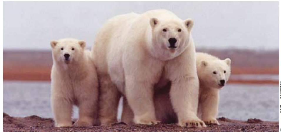
Susanne Miller, USFWS

A species is listed under one of two categories, endangered or threatened, depending on its status and the degree of threat it faces. An "endangered species" is one that is in danger of extinction throughout all or a significant portion of its range. A "threatened species" is one that is likely to become endangered in the foreseeable future throughout all or a significant portion of its range. To help conserve genetic diversity, the ESA defines "species" broadly to include subspecies and (for vertebrates) distinct populations.